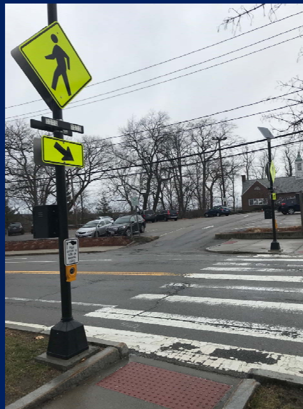
Flashing crosswalk safety lights at key crossings