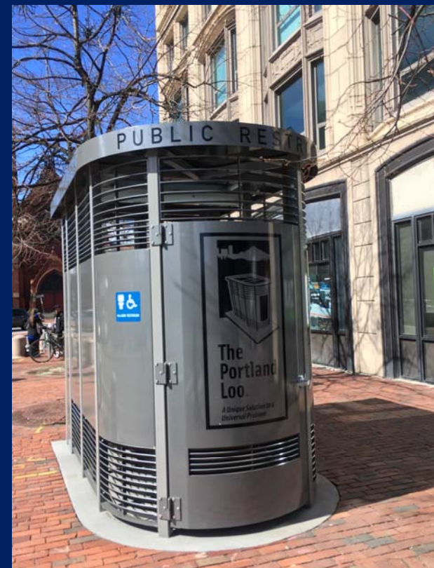
Public "Portland Loo" toilet installed in Central Square