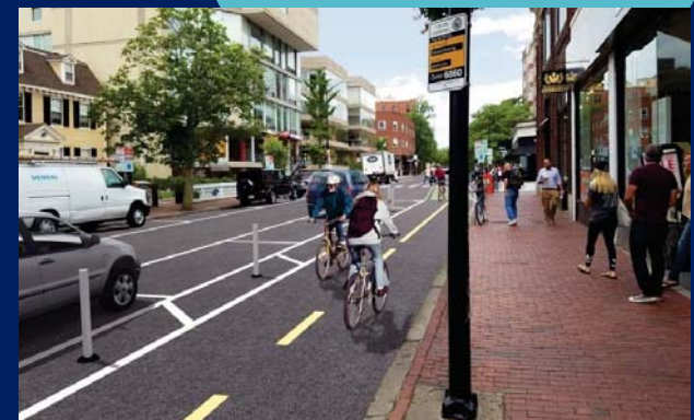
Protected bike lanes in Harvard Square